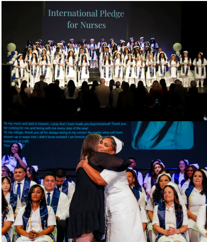
GOAL 1: ELIMINATE BARRIERS TO STUDENT ACCESS & SUCCESS.

The highlight of the evening was when the graduates received their pins, a symbol of their promotion from student to professional nurse. This was also the first time in SBVC history that students were able to choose who pinned them, with the honor going to relatives, spouses, friends, and professors.