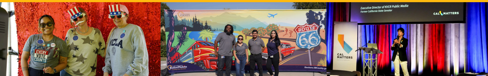
GOAL 3: BE A LEADER & PARTNER IN ADDRESSING REGIONAL ISSUES.

Throughout the semester, SBVC Votes prioritized voter registration efforts, participating in the California University and College Ballot Bowl Competition. These efforts yielded impressive results, with 159 students registering to vote—a significant increase from the 27 registrations in 2022. Additionally, SBVC Votes launched a new website, valleycollege.edu/sbvcvotes , and a dedicated email address to enhance voter outreach. These initiatives were supported by generous funding, including $750 from National Voter Registration Day, $2,500 from the Arts, Lectures, & Diversity Committee, and $10,000 from the First Year Experience program. SBVC Votes' achievements this semester demonstrate the college's commitment to fostering an informed and engaged student body. Through creativity, education, and active participation, SBVC continues to empower its community to make meaningful contributions to democracy.