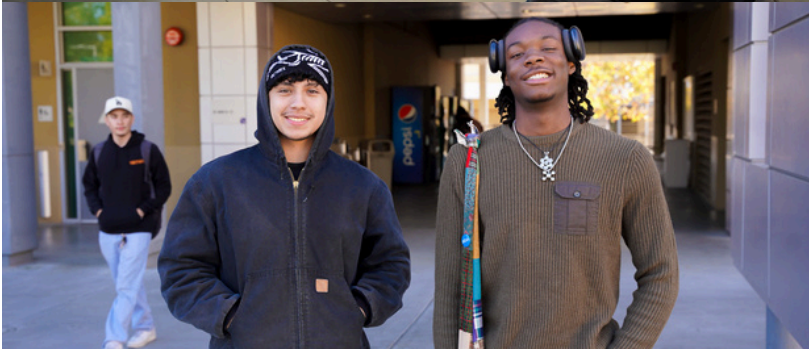
GOAL 1: ELIMINATE BARRIERS TO STUDENT ACCESS & SUCCESS.