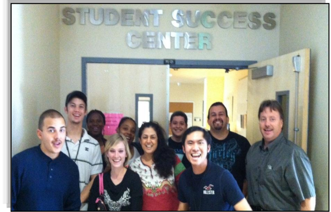
SBVC students and faculty in front of the Student Success Center

The Student Success Center is always a busy place with scheduled and drop-in tutoring services for SBVC students. With tutoring in Computer Technology, Humanities, Math, Science, Social Science, technical topics and the extremely popular course-specific workshops, the center has accomplished an astounding 25,275 student contact hours to date. Open 60 hours each week, staffed by 72 students and two dedicated SBVC employees, the Student Success Center is a perfect place for students to get a little extra help when they need it.