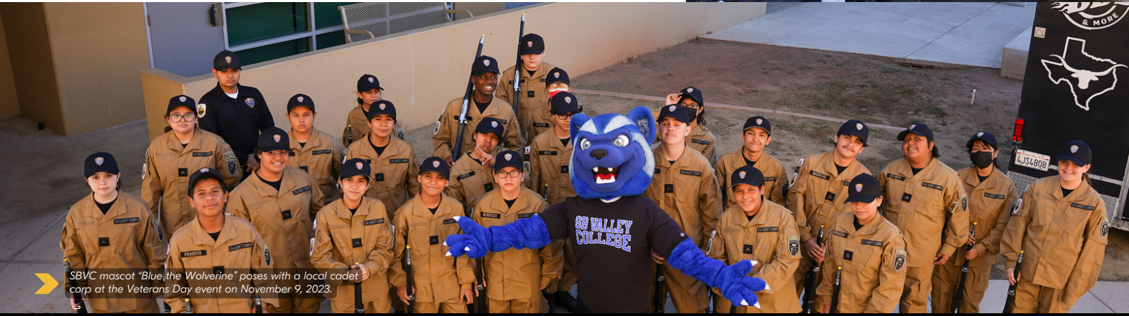
GOAL 3: BE A LEADER & PARTNER IN ADDRESSING REGIONAL ISSUES.